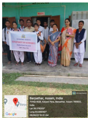
One household survey have been conducted during academic session.