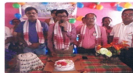
Teacher's day celebration in our college #barpatharcollege