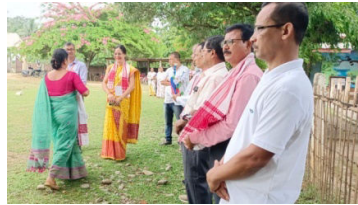
(i) In 2018 External Evaluator