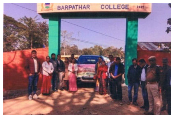
Celebration of Road safety Day organised by Economics and History Deptt. of Barpathar College