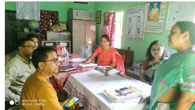
(ii) In 2022 External Evaluator