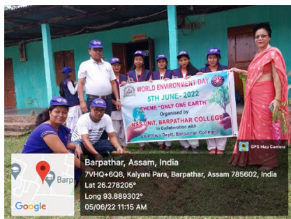
Celebrated World Environmental Day at College Campus