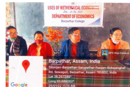
Departmental seminar had been conducted during academic session.