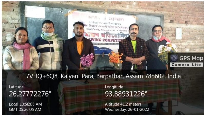
* Organised the Drawing Competition 26/01/2022

* Released (Unveiled) the Departmental Wall Magazine "Siralu" 06/01/2022